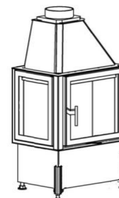
CHOPOK R90 /450 L