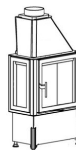
CHOPOK R90 /330 L