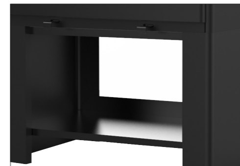
Integrated woodshed length of 70 cm for storing firewood within easy reach.