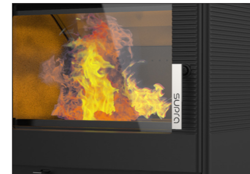
Ergonomic handle ideal for everyday use.