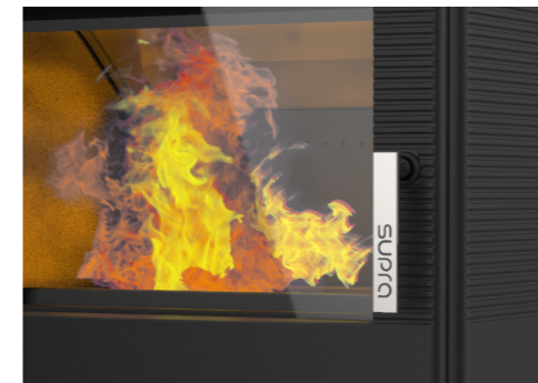
Ergonomic handle ideal for everyday use.