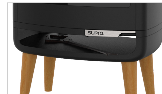
26.5 cm high wooden legs for easy log loading