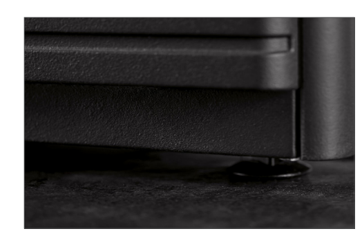
Adjustable base for perfect levelling.