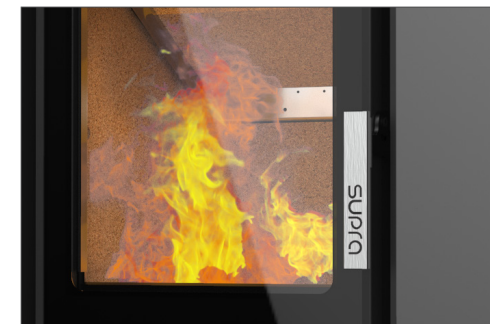
Ergonomic handle adapted for its everyday use.