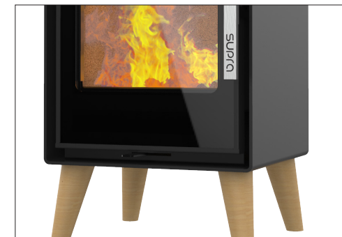
Beautiful Scandinavian style wood burner with wooden legs.