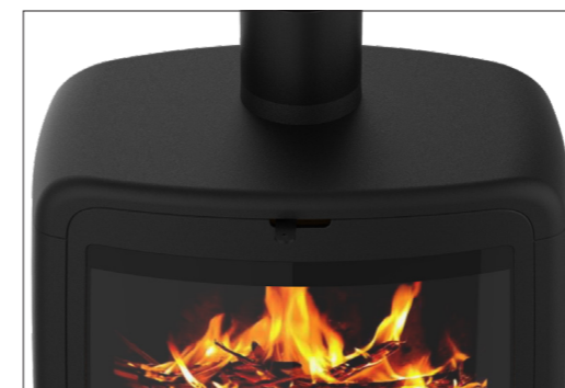
Curved view of the fire , diagonal 52.5 cm (21 inches) (PAUL, PAUL HAUT, PAUL BÜCHER AND PAUL SUR PIED).