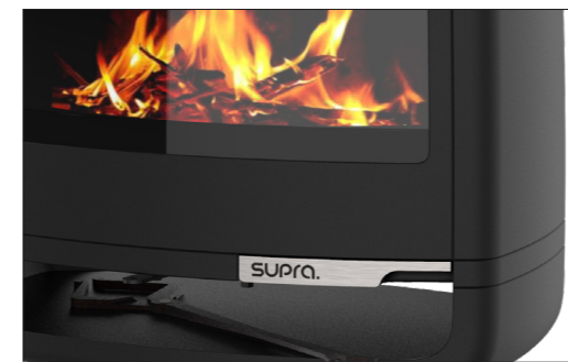
Integrated handle for an elegant design (PAUL, PAUL HAUT, PAUL BÜCHER AND PAUL SUR PIED).