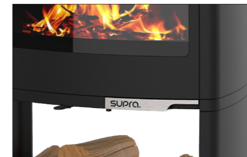
Integrated handle for a elegant design (PAUL, PAUL HAUT, PAUL BÛCHER AND PAUL SUR PIED).