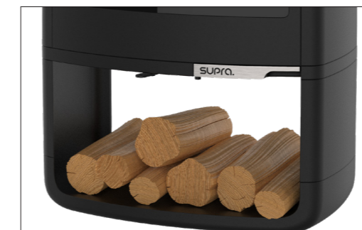
Integrated woodshed length of 70 cm for storing firewood within easy