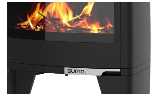
Integrated handle for an elegant design (PAUL, PAUL HAUT, PAUL BÜCHER AND PAUL SUR PIED).