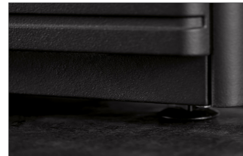
Adjustable legs for perfect levelling.