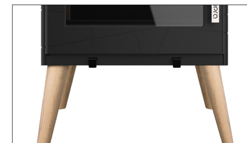
Scandinavian style wooden legs