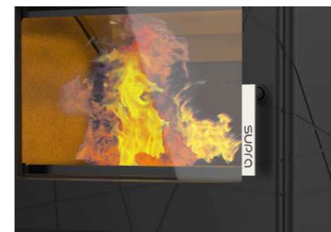
Ergonomic handle adapted for its everyday use.