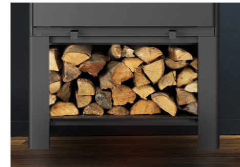
Integrated woodshed length of 62 cm for storing firewood within easy reach.