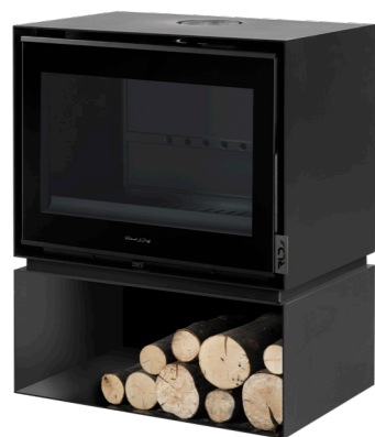
BELLEVILLE 700C FR9011010B EAN: 3760075412005

Everything has been thought of in the BELLEVILLE wood burner so that you can fully enjoy the spectacle of the fire from the living room. Its cubic design brings elegance and a chic air to your home. In addition, its integrated woodshed allows you to have firewood at your fingertips.