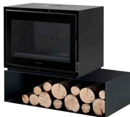
BELLEVILLE 700CL FR9011002B EAN: 3760075412012