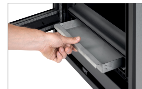
Lowered ashtray for a better view of the fire.