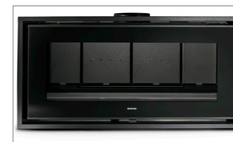
Panoramic format: the choice for XXL fire view