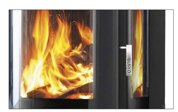
Simplified everyday use: high handle designed to be held without bending over.

Even more fun: heater with a triple view of the fire.