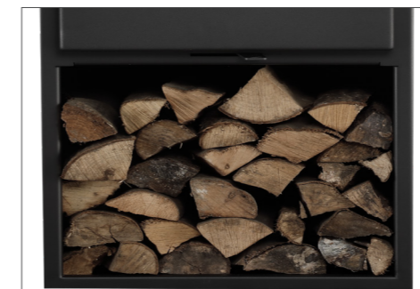
Integrated woodshed length of 41 cm for storing firewood within easy.