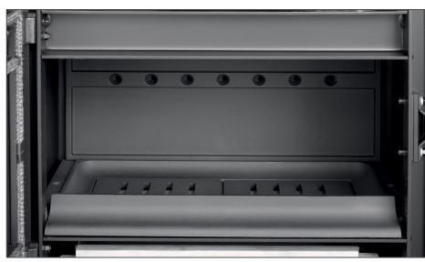
Interior of hearth plate, hearth plate and cast iron grates (NEO 55, 67, 76 and 76 16/9ÈME).